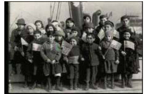
A group of immigrant children in the early 1900's. Immigrant families would stop at Ellis Island in New York harbor to officially become citizens of the United States of America.

Especially in America, many people had heard that jobs and conditions were better than they were in Europe. Sometimes these stories were exaggerated or just wrong. These people would often sell everything they had just for a ticket to be able to come to America. These people were especially vulnerable to being exploited. Since they literally would only have the clothes on their back when they arrived, they had to take the first opportunity that was offered to them. Sometimes, factory owners would rent apartments to these immigrants in exchange for their work, but the apartments would be slums, with rats, roaches, and little in the way of furniture.