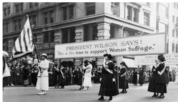
A women's march in New York City proclaiming that they should have a right to vote. Women gained the right to vote in America in 1913. They were granted the right to vote in Britain the same as men (age 21) in 1928.

Labor Unions also began to form during this time. A labor union is basically a group of workers who join together to stand up to a factory owner or business owner. If the workers feel that they are being taken advantage of, they have the ability to strike, or refuse to work. Since a business owner won't make money if nobody is working for him, they became more motivated to give better working conditions, and better pay to workers when they showed they were willing to go on strike. Since union workers don't get paid while they are on strike, it is also in their best interest to figure out a way to accept what the owner is willing to offer.