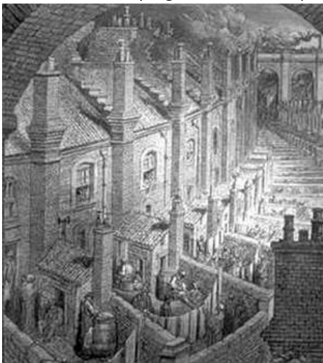
Tenement Buildings, like the ones shown above, were often over-crowded. Sometimes, several families would share a one bedroom apartment.

Another thing that didn't exist at this time was a minimum wage. Factory owners knew that people moving to the cities needed a job, or they wouldn't be able to feed their families, so they didn't pay very much. This is another supply and demand situation, the supply of workers was very high, therefore the price of the worker (the salary owners have to pay them) was low. At this time, there was no government welfare programs, so not working wasn't an option, since literally your children would starve to death.