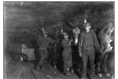
Children working in a mine during the Industrial Revolution

During this time, it was common for women or even children to also have to work to support the family, due to the extremely low wages. Many children by age 10 or 12, would have to drop out of school and begin working. Children were smaller than adults, and therefore could fit in smaller spaces than adults. This was very good in the growing cities, where