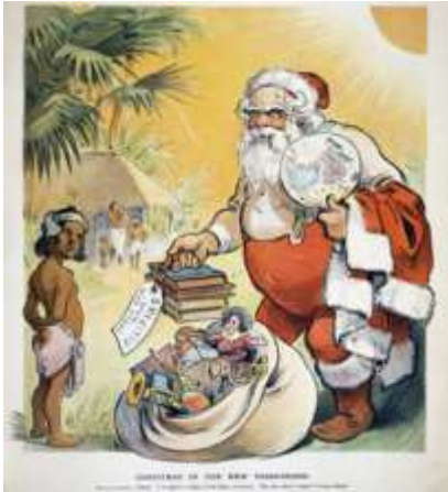
"Christmas in our new possession." Santa Clause shown bringing books to a Philipino boy. The implication is that people in these areas should be grateful to US and Europeans for all the good things they bring to them.

During the 1800's, a leading scientific writer, called Charles Darwin, would